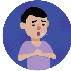
Shortness of Breath or Difficulty Breathing